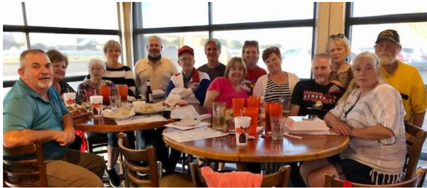
JULY 2020 Social at Hooters Restaurant