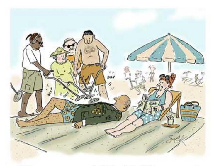
"Serves you right - I told you not to wear those to the beach."