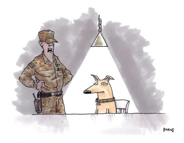
"Let's try this one more time, soldier - where's the other shoe?!"