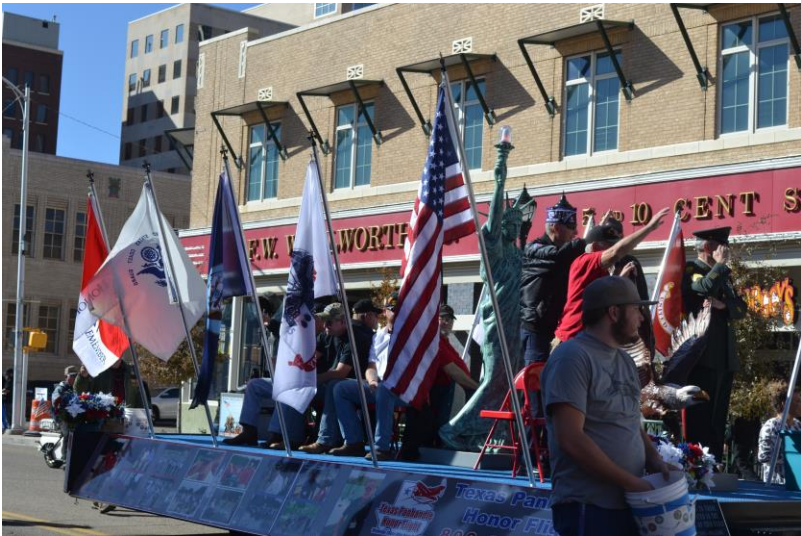
From the 2020 Veterans Day parade